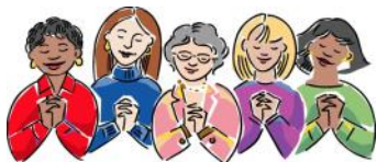
Ladies Prayer Meeting Monday, Dec. 5th @ 7:00 pm