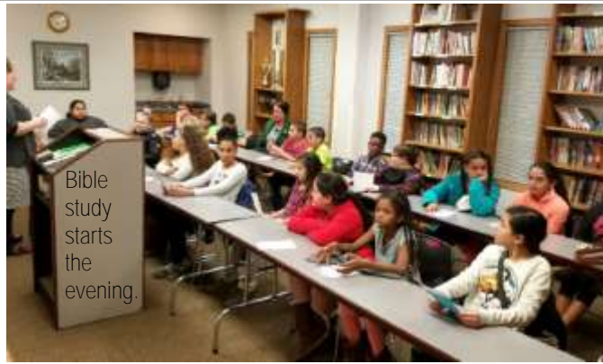
Bible study starts the evening.