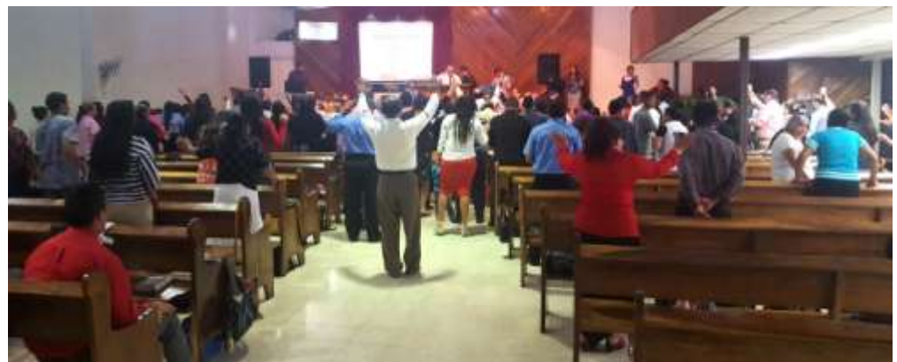
Clockwise: Preaching in Pavas; With the youth group in Desamparados; Bible School teachers and students; Altar call during the National Prayer and Fasting Seminar