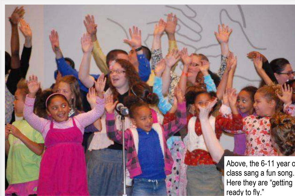
Above, the 6-11 year old class sang a fun song. Here they are "getting ready to fly."