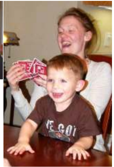
Various families hosted New Year's Eve fellowships. Always fun!