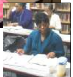
Bible-based living in 101